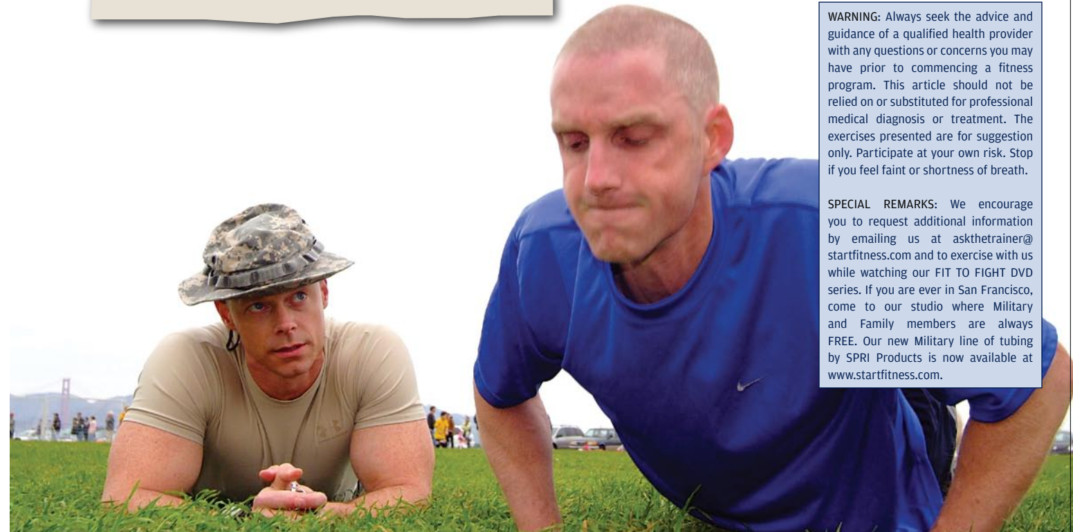
ILLUSTRATION BY SEAMAS GALLAGHER; NICOLE SYLVESTER

SPECIAL REMARKS: We encourage you to request additional information by emailing us at askthetrainer@startfitness.com and to exercise with us while watching our FIT TO FIGHT DVD series. If you are ever in San Francisco, come to our studio where Military and Family members are always FREE. Our new Military line of tubing by SPRI Products is now available at www.startfitness.com .